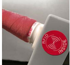
system to protect the customer quality standard through RFID technology