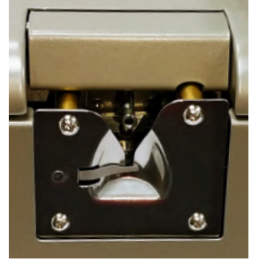
Automatic threading paired YRS® - Our proprietary with unique Yarn Monitor Switch (YMS)