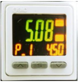
Air pressure digital meter to prevent the malfunctioning of the machine during operation